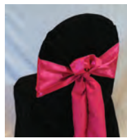
obi (additional $0.50)