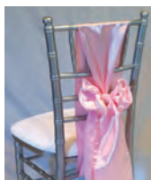
up/down bow (chiavari and garden only) (additional $0.35)