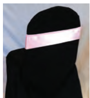
band (additional $0.35)

All sash ties can be done on chair covers, chiavari chairs, or garden chairs unless otherwise indicated