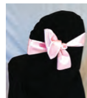
fan (additional $0.30)