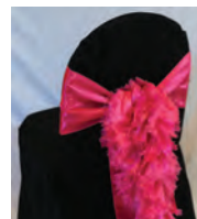
ruffle sash (additional $2.50)