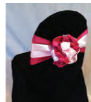
double loose rosette (additional $3.60)