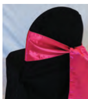
side sash (additional $0.25)