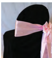
side bow (additional $0.50)