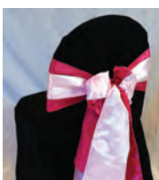
double bow (additional $1.85)