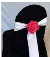
flower clip (additional $1.50)