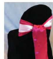
combo (additional $1.60)