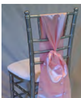
up/down (chiavari and garden only)