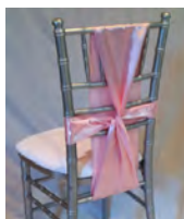
chiavari cross (additional $1.00) chiavari only