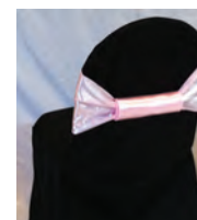
tootsie roll (additional $0.85)