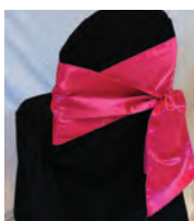
double wrap knot (additional $0.30)