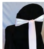
thin satin knot