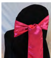
thick satin knot