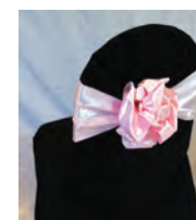
loose rosette (additional $1.50)