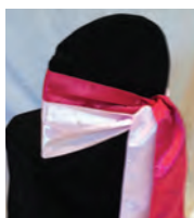
two-tone (additional $1.75)