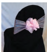
organza flower (additional $0.50)