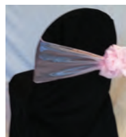
side organza flower (additional $0.65)