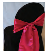
loose satin knot (additional $0.50)