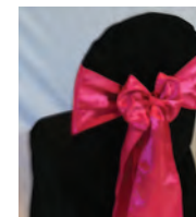
satin bow (additional $0.35)