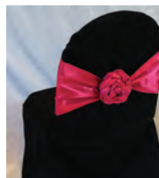
rosette (additional $1.75)