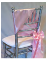
chiavari wrap (additional $1.25) chiavari only