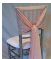
chiavari swag (additional $0.50)