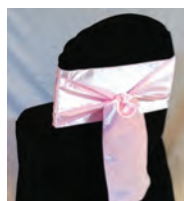
twist (additional $0.40)